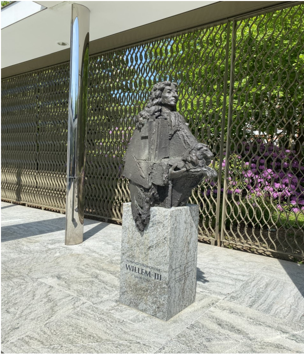
William of Orange