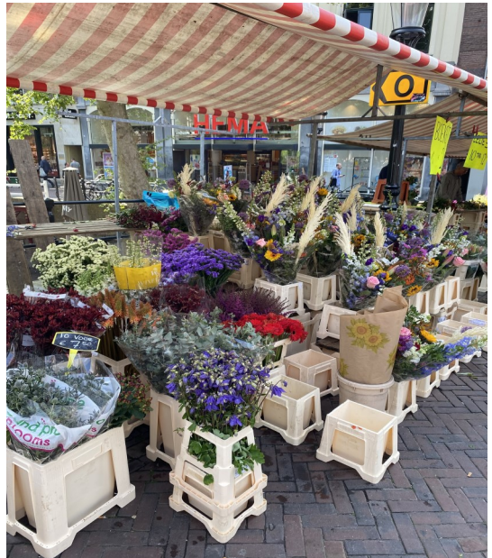
Flowers for Mother's Day