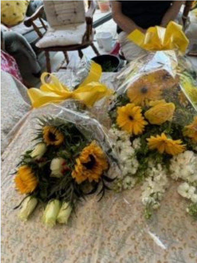
Today at flower arranging was making proper bouquets