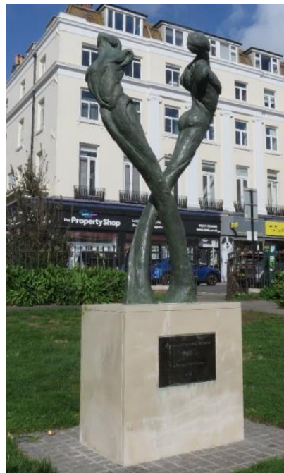
The Aids memorial in Kemptown

But pure LGBTQ spaces are closing for a variety of reasons, including economics, safety, the fact that usage of these spaces is being diluted, giving rise to an anxiety among the LGBTQ community.