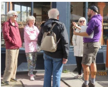
Opposite the Black Lion, on top of a now closed public toilet used by the queer community having 'cottaging' explained to us

We learned that 'queer' was a pre-WWII term and that 'gay' did not enter common usage for the same thing until the 1950s. We learned that 'cottaging' was often safer than living together and being recognised as consenting criminals, and that more often than not it was queer men servicing straight men!